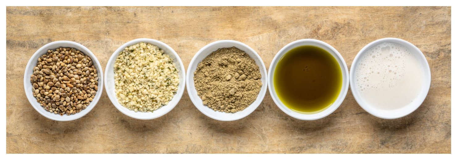
Hemp seed products: hearts, protein powder, oil & milk

To build upon ongoing collaborations and coordination across the hemp industry, Oregon State University's Global Hemp Innovation Center and the USDA co-organized the National Hemp Industry Research Needs Workshop in November 2022. The workshop brought together leaders from academia, industry, and government to identify the significant gaps, challenges, and opportunities for research to support development of a globally competitive U.S. hemp industry. The Workshop focused on six topics spanning all aspects of hemp value chains: plant breeding and genetics, sustainable agricultural production, harvest and materials processing, product manufacturing and supply chains, economics and markets, and testing and compliance.